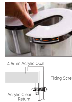
*Fabrication of acrylic clear return to reinforce.