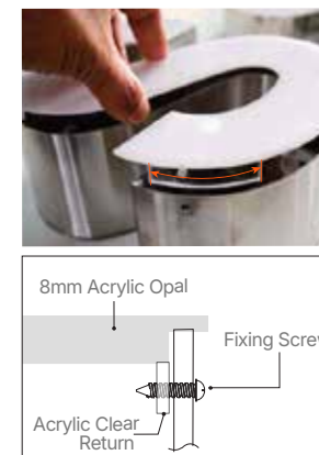
*Fabrication of acrylic clear return to reinforce.